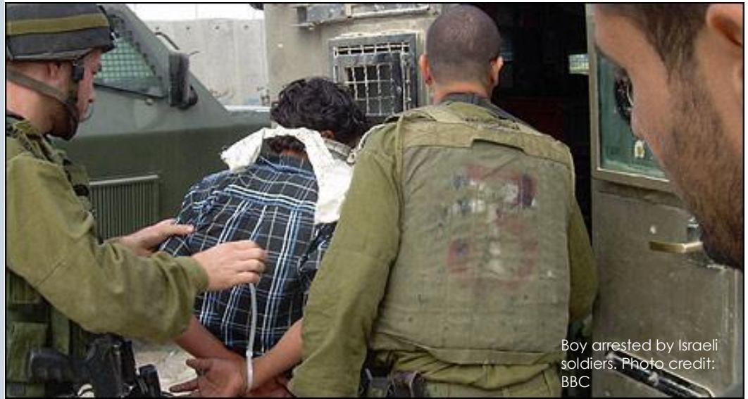
Boy arrested by Israeli soldiers.