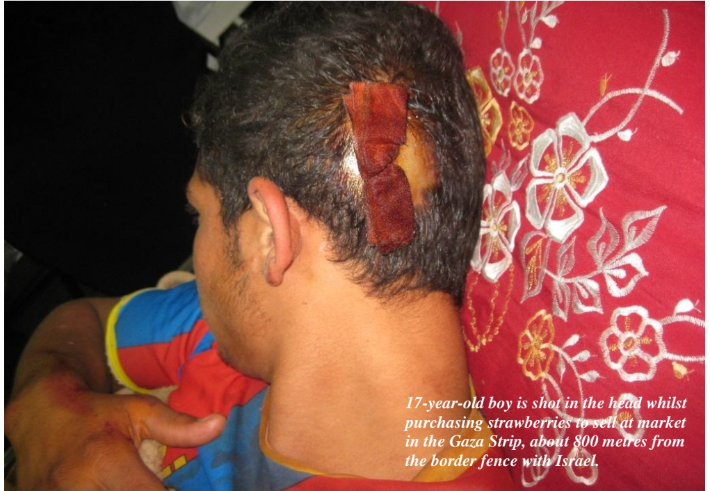
17-year-old boy is shot in the head whilst purchasing strawberries to sell at market in the Gaza Strip, about 800 metres from the border fence with Israel.